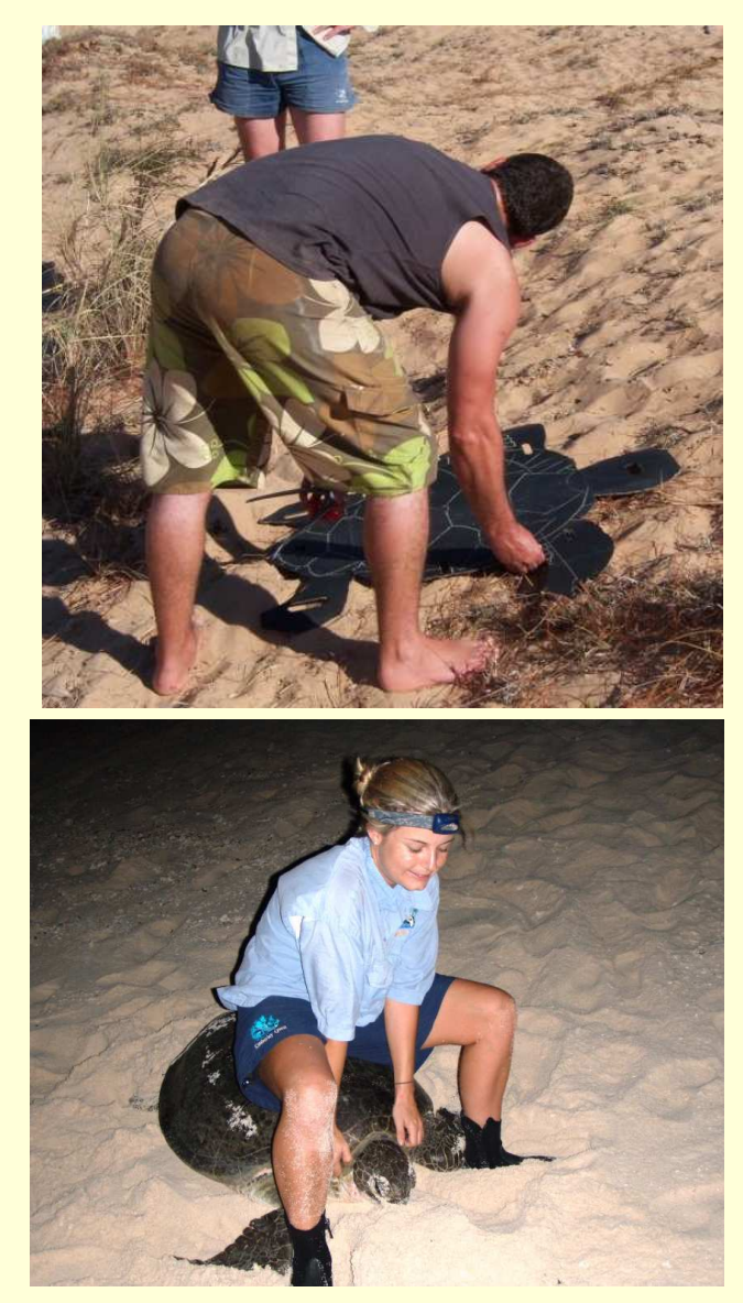
Figure 3. Research assistant training with a mock turtle (above) and restraining a green turtle after nesting with TI and maintaining three points of contact, a straight back, feet in front of the flippers and fingers away from the turtle's mouth.

This is especially important when dealing with companies that need Job Hazard Assessments with strict injury reporting procedures (Figure 4) and conservation agencies that want ethical low-stress handling of wildlife (Figure 5).