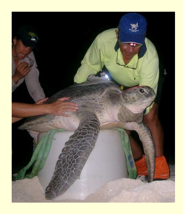
Figure 5. TI applied to adult turtles after nesting as a satellite transmitter is attached to a green turtle (left) and as a flatback turtle is tagged "on the run" as she returns to the water (right).