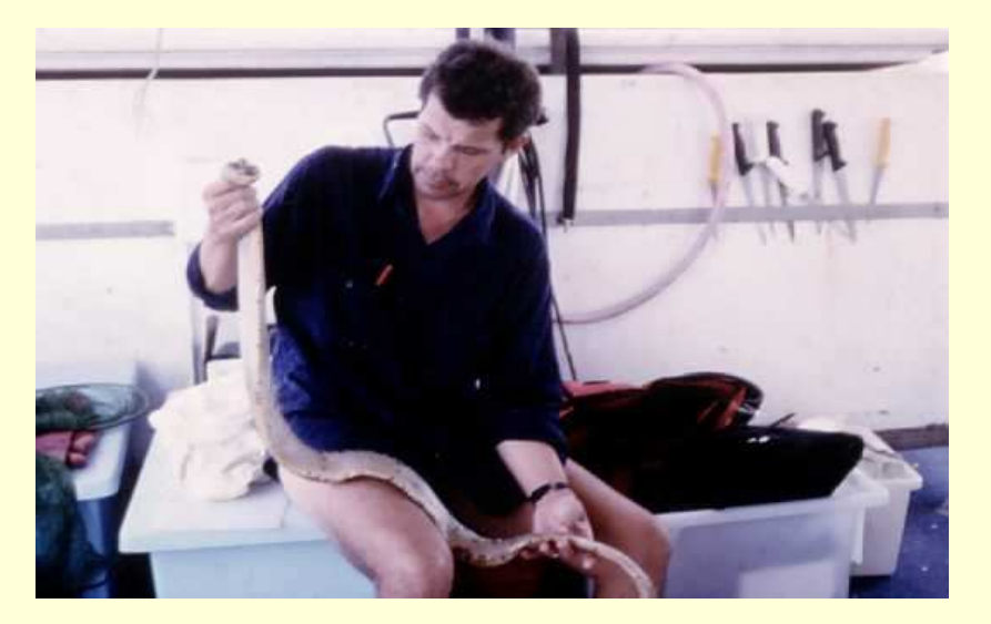
Figure 1. The author with a Stokes Sea snake relaxed by TI.

It has been used by the author to immobilise sea snakes for measuring and tagging prior to release (Figure 1).