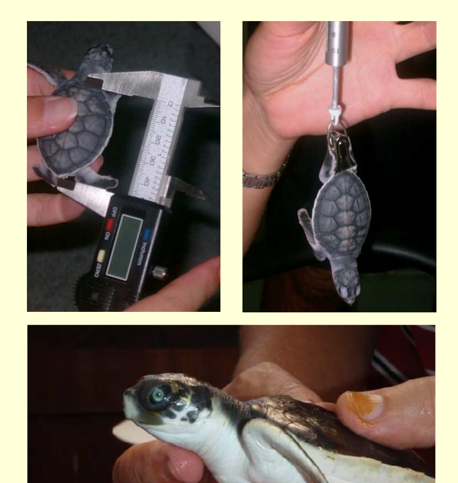
Figure 2. TI used in measuring (top left), weighing (top right) and initiated by stroking the throat region (lower).